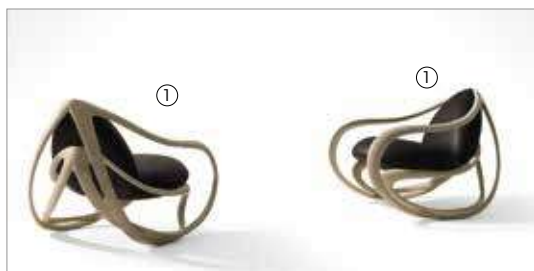
1 Move 69810 leather 9122 fin.96