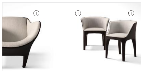
1 Diana 70701 leather 9122/dundee 6001